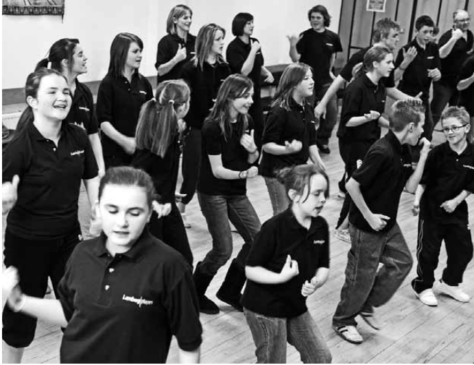
It's early days yet!