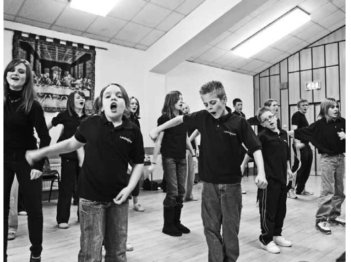
Michael Jackson eat your heart out.