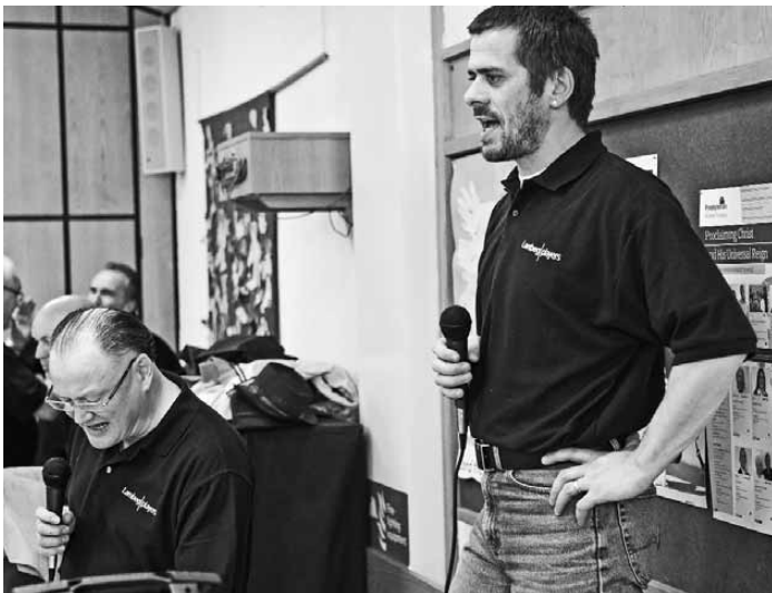
The producers showing their 'X' factor.