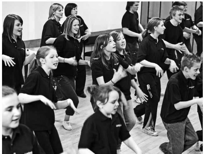
Multiple Tommy Cooper impressions.