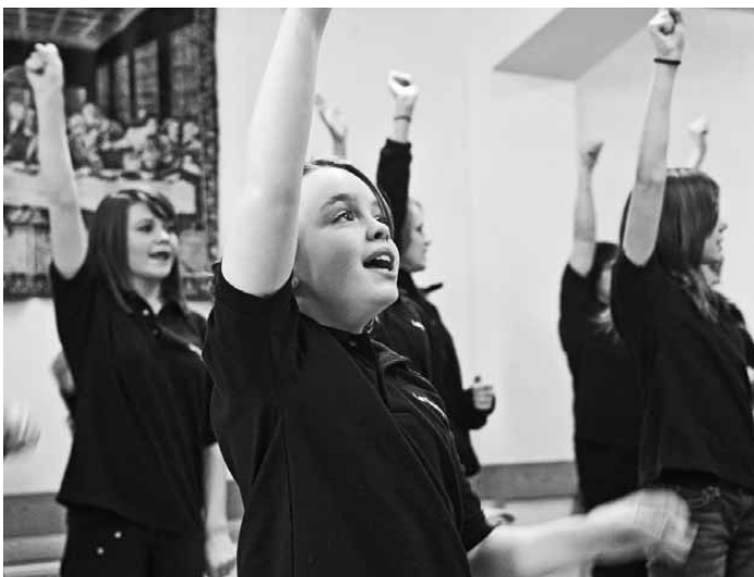
The ubiquitous toilet break request.