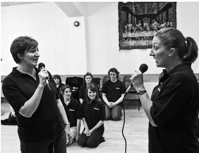
Twin voices in perfect harmony.