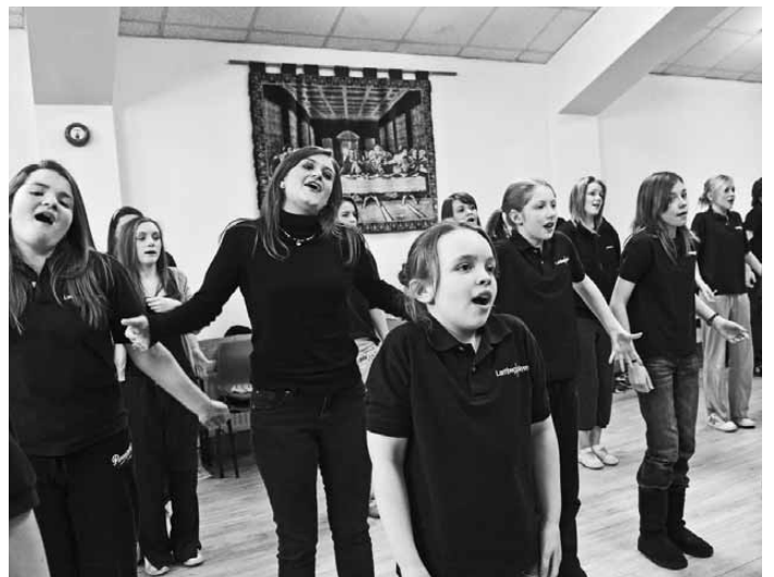
"What do we care if it's all wrong".