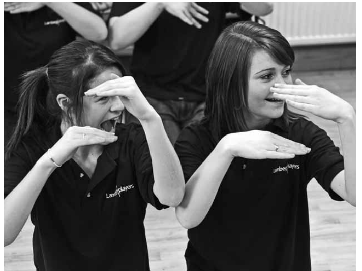
No photos please!