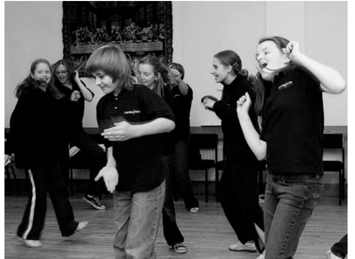
Random dance movements - the only ones they know!