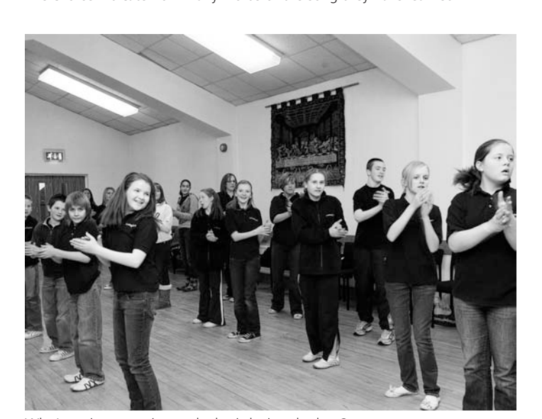
Who's paying attention and who is loving the lens?