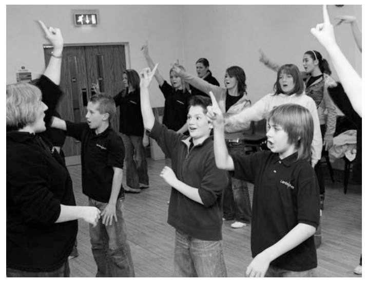
The chorus indicate how many words of the song they have learned.