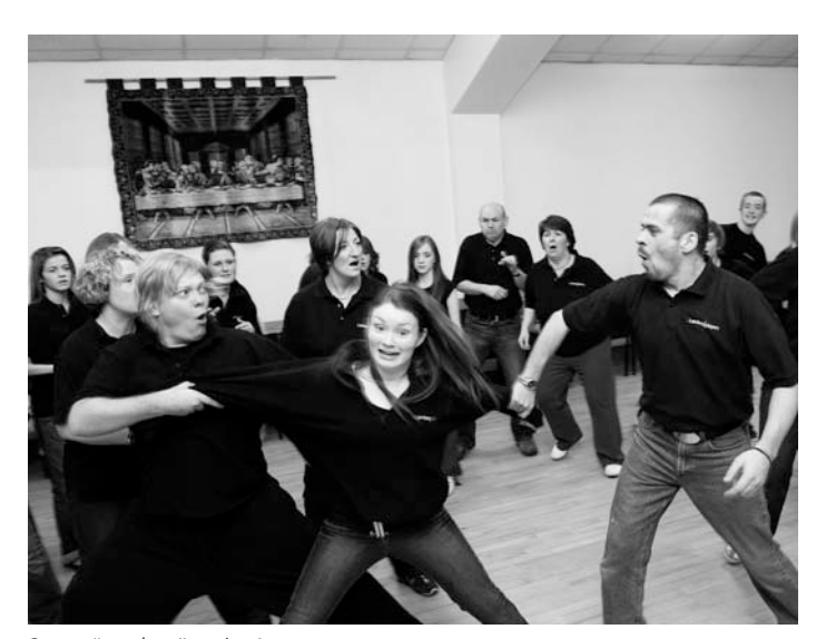
Some "armless" acting!